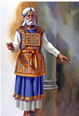
Aaron is Attentive to Adonai!